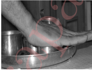
Figure 3: Covering the vessel with your right palm.

oṃ namo nārāyaṇāya arghyaṃ parikalpayāmi