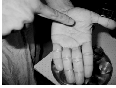
Figure 6: Scribing vam on your left palm with the right index finger.

Develop the surabhi mudrā on your hands as shown in Figure 7. This is done by touching your left little and right ring fingers, left ring and right little fingers, left index and right middle fingers, and left middle and right index fingers.