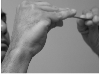
Figure 2: Covering a spoonful of water from pūrṇakumbham and raising up to the level of the nose.