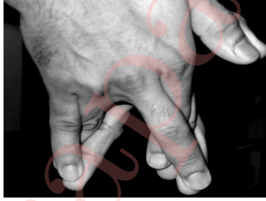
Figure 7: Configuring surabhi mudrā with the right hand.

Develop the surabhi mudrā on your hands as shown in Figure 7. This is done by touching your left little and right ring fingers, left ring and right little fingers, left index and right middle fingers, and left middle and right index fingers.