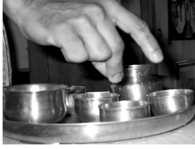
Figure 8: Snapping above the vessel.

and performing the astramantram over the IUC will be referred to as śoṣaṇam-dāhanam-plāvanam-surabhimudrā-astramantram to that IUC, for brevity.