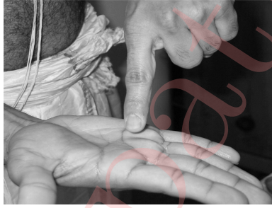
Figure 5: Scribing yaṁ on your right palm with the left index finger.

Either imagine the word yaṁ written on your right palm or scribe the word yaṁ , in the script you are comfortable with, on your right palm with your left index figure, as shown in Figure 5.